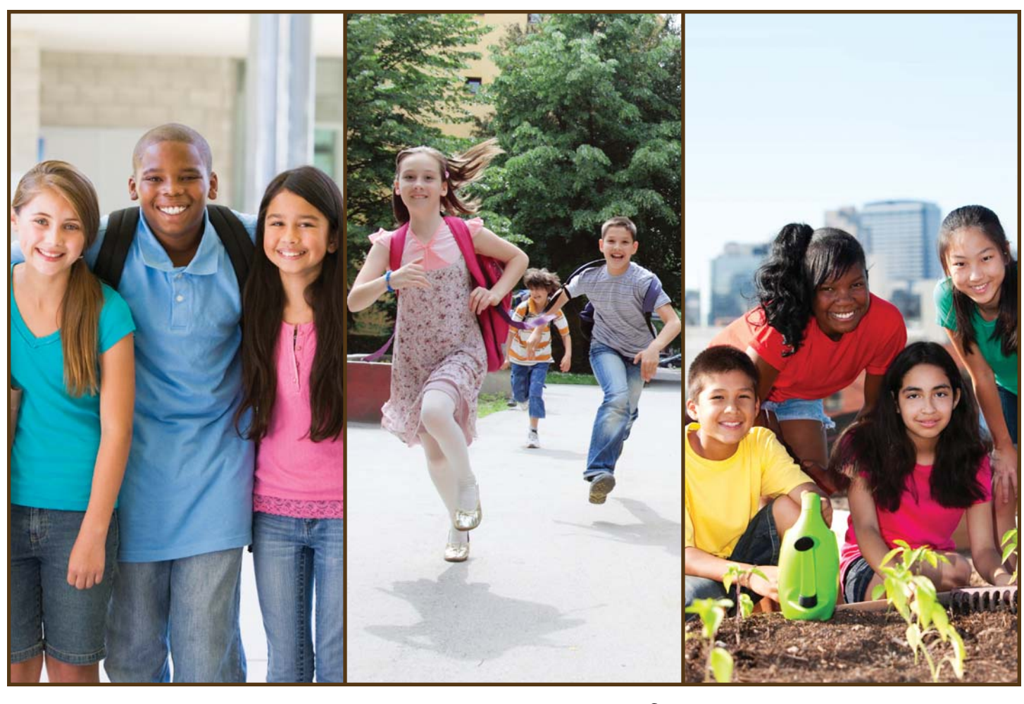
Supportive Environments for Learning:

Healthy Eating and Physical Activity Within Comprehensive School Health